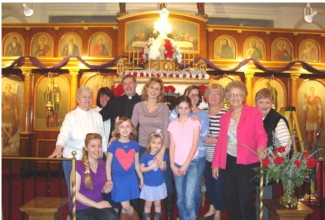
Decorators of the Epitaphios—Friday Morning