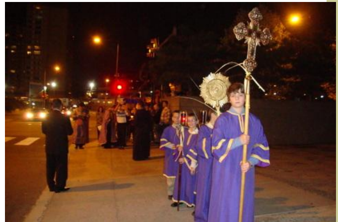
Holy Friday—The Funeral Procession