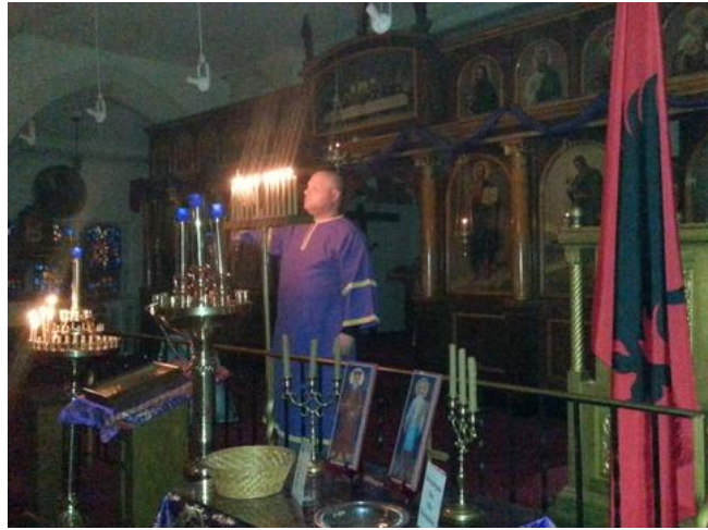
Holy Thursday—Reading of the Twelve Gos-