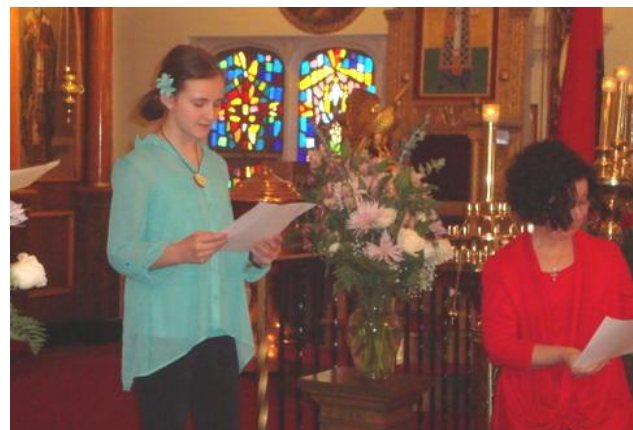
Agape Service—The Gospel read in many languages