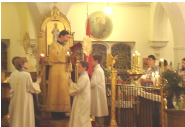
Pascha— Reading the Gospel