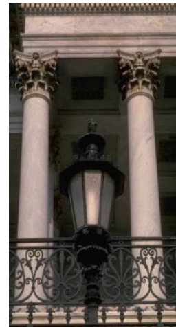
Pillars of St. John Chrysostom