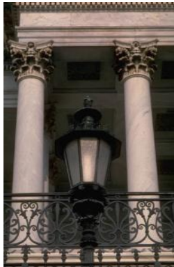
Pillars of St. John Chrysostom