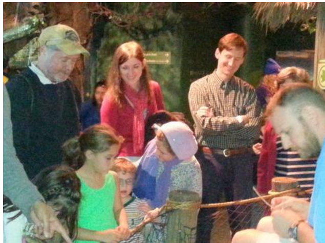
Sunday School Trip to the Aquarium