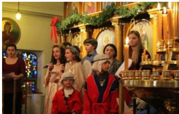
2013 Christmas Pageant